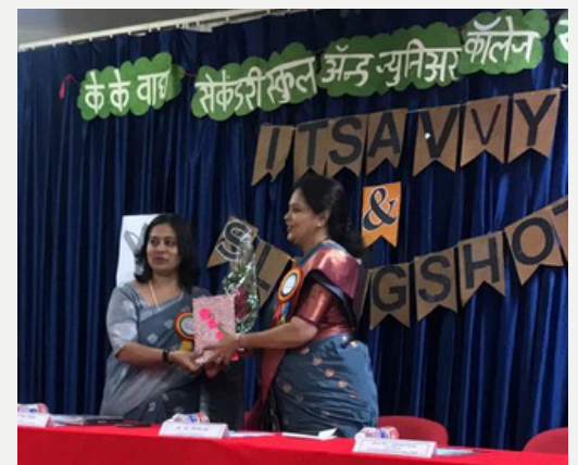
Prize Winners of IT-Savvy & Slingshot 2024